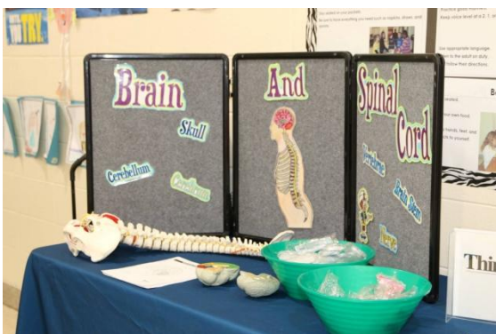
A few pictures from the PTA Science Fair held on February 4 th .